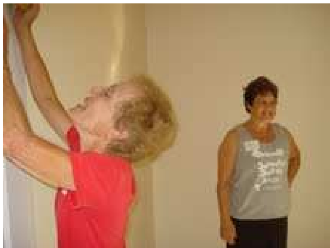
Pictured: Volunteers working at Habitat for Humanity Faith Build, August 6, 2011.

We're on the Web! www.holytrinitylutheranchurch.com